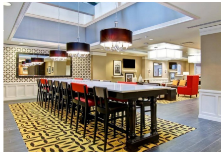
Hampton Inn & Suites Downtown Cincinnati, OH Hotel (hilton.com)