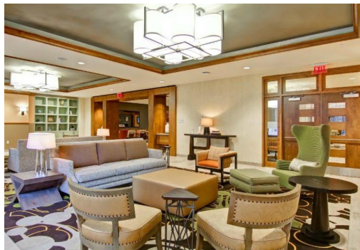
Homewood Suites Downtown Cincinnati, Ohio Hotel (hilton.com)