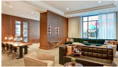
Historic Downtown Hotel - The Cincinnati, Curio Collection (hilton.com)