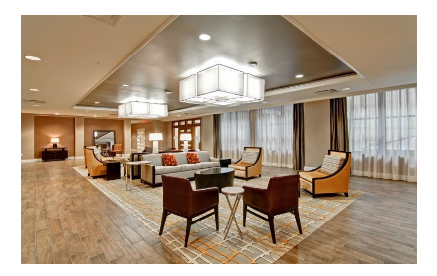
breaks. are served twice daily.

Beverages and substantial snacks are also served during two daily